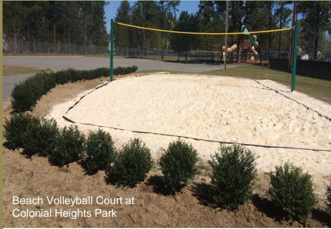
Beach Volleyball Court at Colonial Heights Park

Pools provide a refreshing break from the summer heat, but have you made sure your pool is safe for you and your family? Any electrical device in and around swimming pools such as pumps and lighting require GFCI protection and proper bonding and grounding systems are important safeguards against current traveling to the pool from outside its immediate area. Existing GFCIs require periodic testing per manufacturer specifications to insure they will function properly when needed. If you are uncertain if your pool is safe from electric malfunction that can result in injury or even death we urge you to contact a licensed electrician for evaluation of your systems. We want you to have a fun and safe summer.